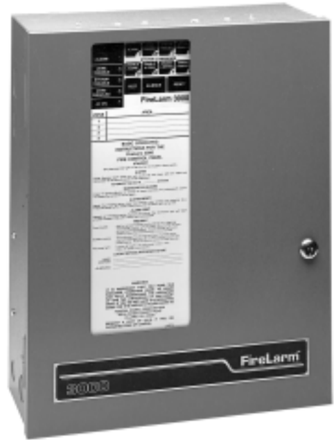
FireLarm 3000 CONTROL UNIT

The operator's digital display keypad uses LED's, a numeric display and a sounder to activate and report AC on, system status, test, silence, reset, zone/device disable and alarm/trouble recall. An optional remote annunciator indicates system trouble and displays alarm and trouble conditions by zone. The optional remote interface provides alarm and trouble outputs per zone to operate lamp-type annunciators or relays. The Test mode permits single person panel checkout by sounding two short blasts on the alarm signals for activation and one blast for automatic reset. The fire drill feature activates the alarm signal circuits without operating the optional communicators.