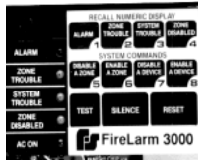
OPERATOR'S DIGITAL DISPLAY KEYPAD